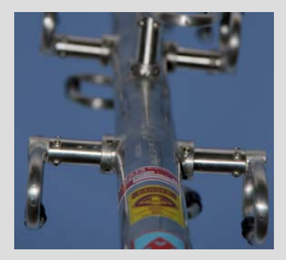
Fully sealed internal phasing harness